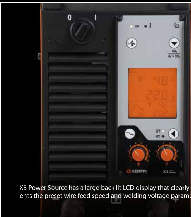
X3 Power Source has a large back lit LCD display that clearly presents the preset wire feed speed and welding voltage parameters.