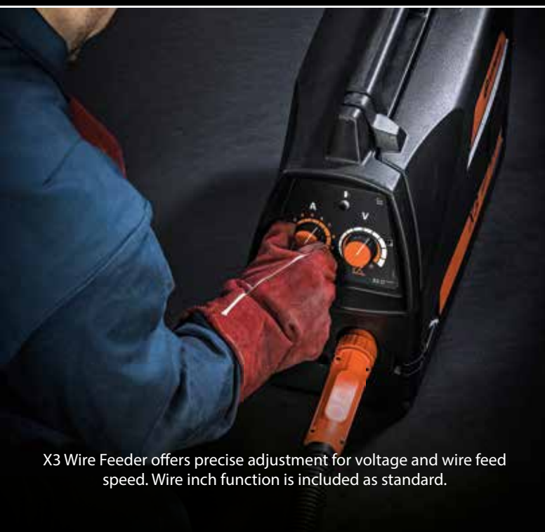
X3 Wire Feeder offers precise adjustment for voltage and wire feed speed. Wire inch function is included as standard.

When working in tough conditions at a construction site, shipyard or a metal fabrication workshop, or doing maintenance welding on a pipeline site in extreme temperatures, you need a companion that you can fully trust on.