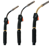
MMT/PMT gun range

The FE range's great combination of professional performance with the comfort, value, and flexibility of a gas-cooled MIG/MAG gun suited to light to medium duty performance, makes it a solid choice for our customers.