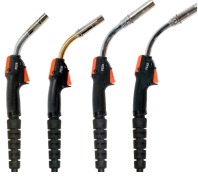
FE gun range

The FE range's great combination of professional performance with the comfort, value, and flexibility of a gas-cooled MIG/MAG gun suited to light to medium duty performance, makes it a solid choice for our customers.