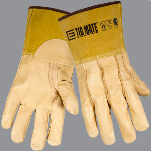
TIG11 TIGMATE SHORT CUFF Welding Gloves