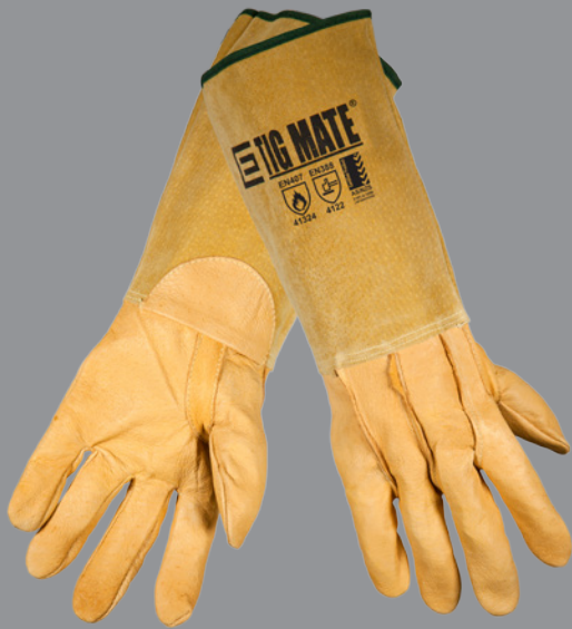
TIG16 TIGMATE LONG CUFF Welding Gloves