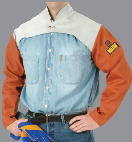
WAK10WY WAKATAC® PROBAN WITH YOKE

All Wakatac® Proban® Cotton Welding apparel is made from safe to wear Proban® 100% cotton. Proban® fabrics meet the requirements of the OEKO-TEX® standard 100 'Confidence in Textiles'.