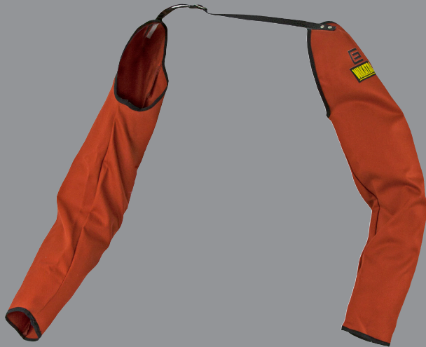
WAK10 WAKATAC® PROBAN WITHOUT YOKE