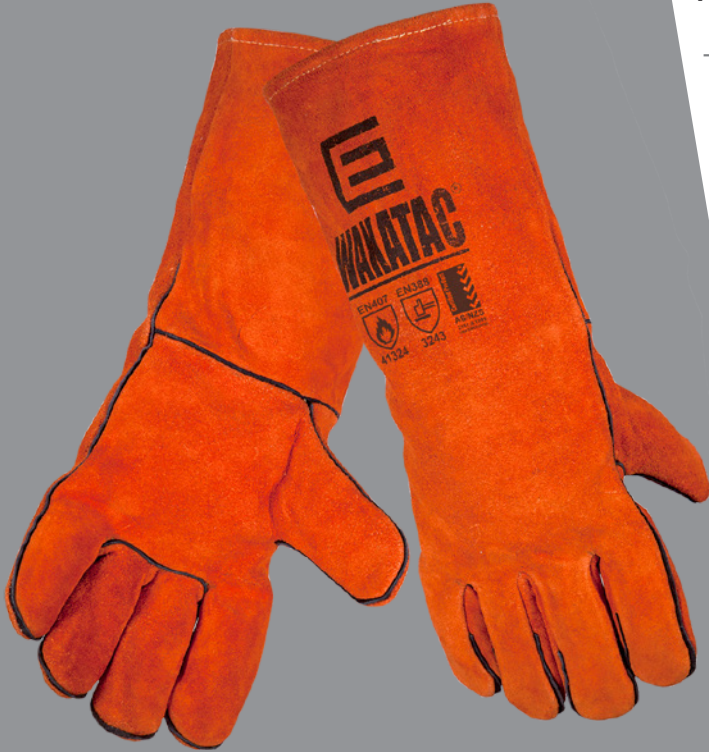
300WAK WAKATAC Welding Gloves