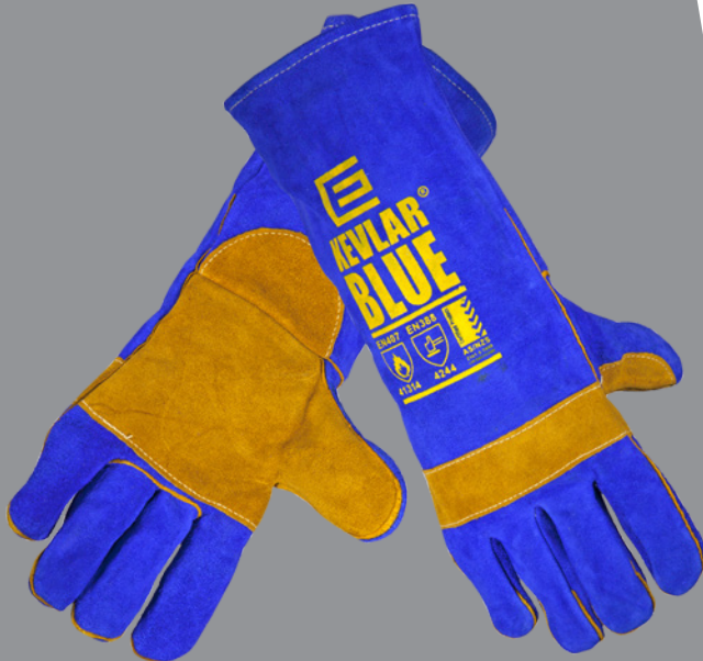
300RKB KEVLAR® BLUE™ Welding Gloves