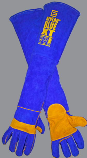
300RKBXT KEVLAR® BLUE™ XT Welding Gloves