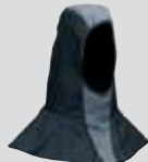
16 91 00