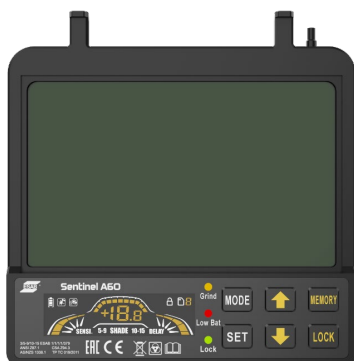
Advanced CE 1/1/1/1 ADF technology with a simple interface and clear graphic display.