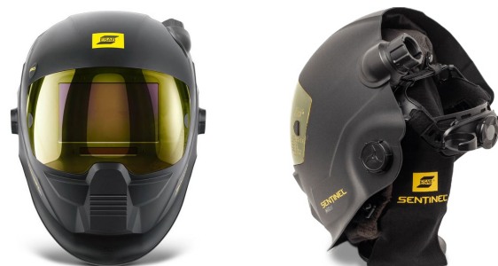
Compact shell with optional amber-coloured protective outer lens.