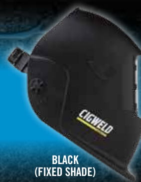
BLACK (FIXED SHADE)