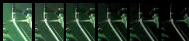
Shade #8 Shade #9 Shade #10 Shade #11 Shade #12 Shade #13