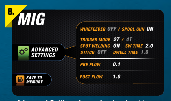
Advanced Settings for professional welds