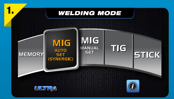
Choose MIG AUTO SET (SYNERGIC)

With excellent welding performance across a broad range of applications anyone can weld like a Pro! You set the process - MIG, TIG or STICK and the Ultra does the rest!