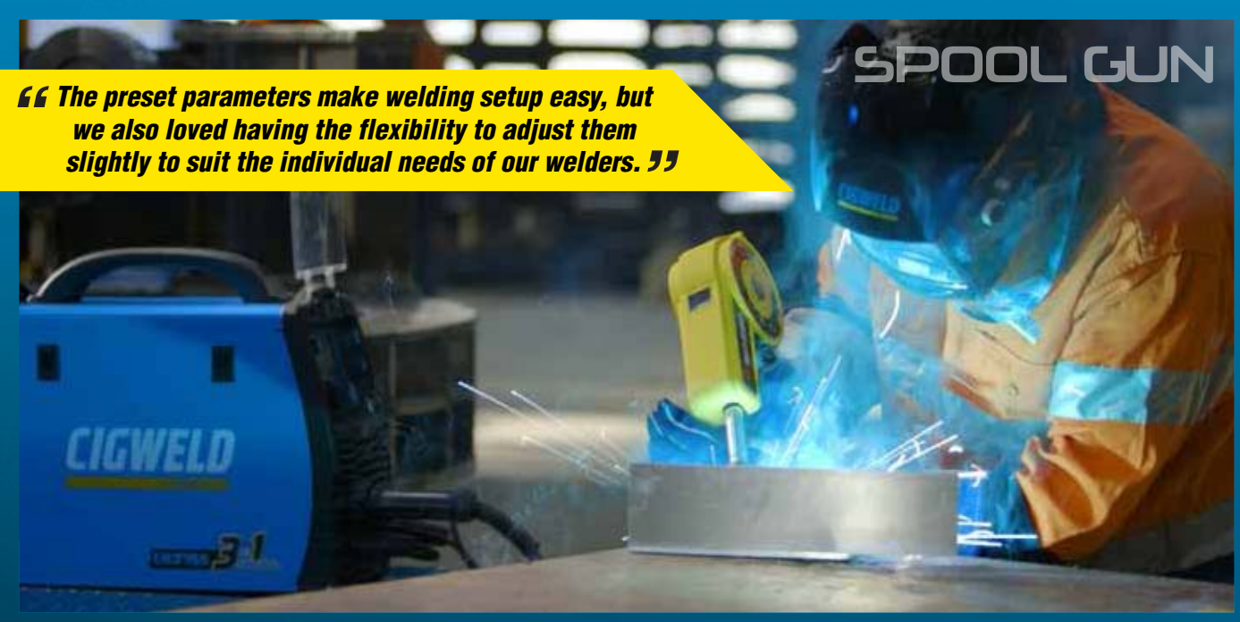
Optional SGT250 Spool Gun ideal for your precision aluminium fabrication, repairs and auto/marine work.

It really is child's play! Just plug it in - and weld away!