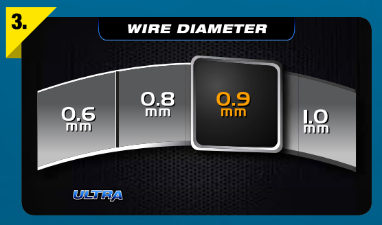
Choose WIRE DIAMETER