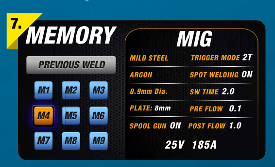
Memory Screen to save your favourite welds