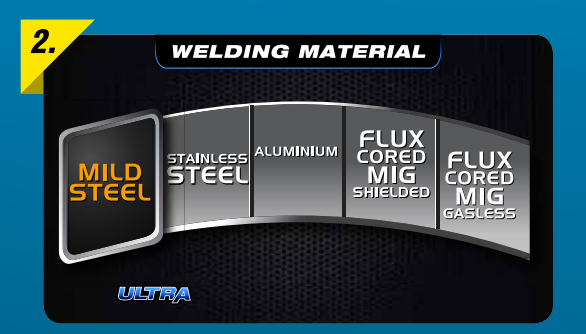
Choose your MATERIAL (in this case MILD STEEL)