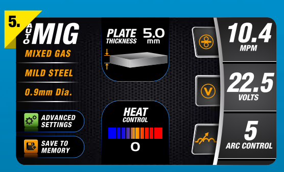
Summary Screen displays your AUTO SET parameters