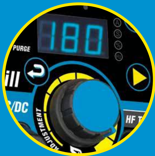
Blue LEDs for improved visibility outdoors.

The CIGWELD WeldSkill 180 AC/DC comes as a complete kit with an 4m Remote Control TIG Torch, Argon Regulator/Flowmeter, 4m Electrode Holder and Work Clamp and a TIG Accessory Kit with tungstens, nozzles, collets etc. to get you up and welding in no time.