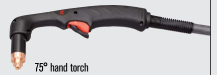
75° hand torch

(for more torch options, see www.hypertherm.com )