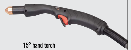
15° hand torch