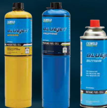
● MAXGAS ○ PROPANE ● BUTANE

STEP 2. Match application to corresponding fuel and a flame type