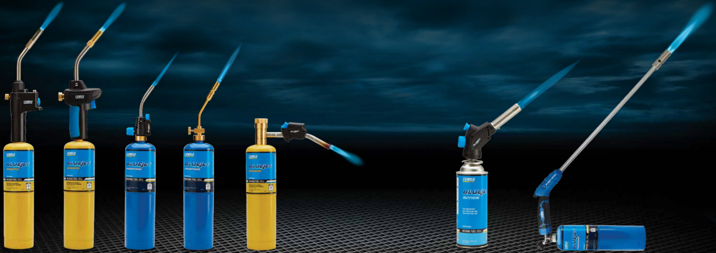
JET407 SUPER CYCLONE FLAME