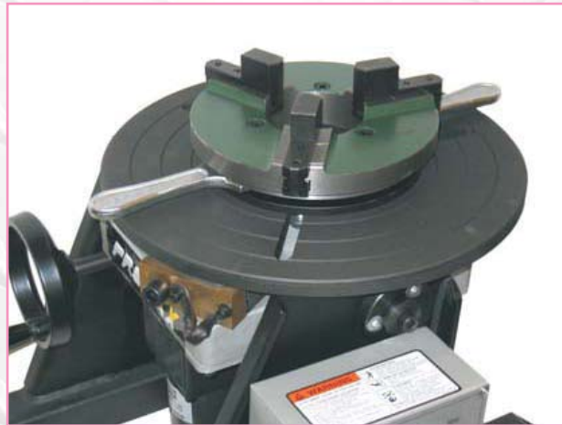
Welding Positioner Chuck mounted onto the WP250-2 Positioner