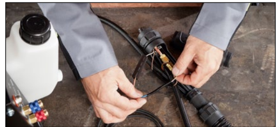
4. Mount the shrink hose for insulation.