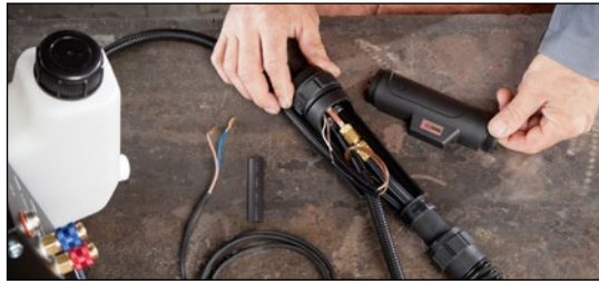
1. Open the machine side connection housing.

(The flow switch set is included in the scope of delivery of the cooling unit.)