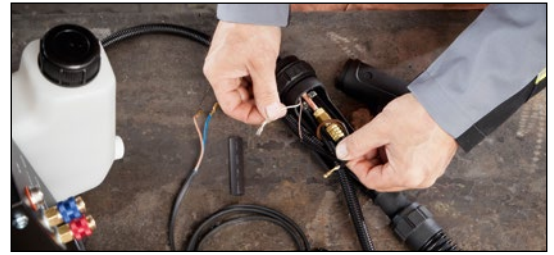
2. Disassemble end of the trigger cable.