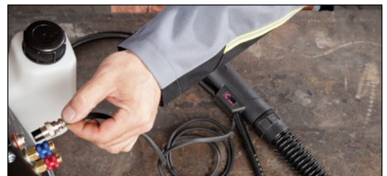
8. Connect the flow control cable to the cooling unit.