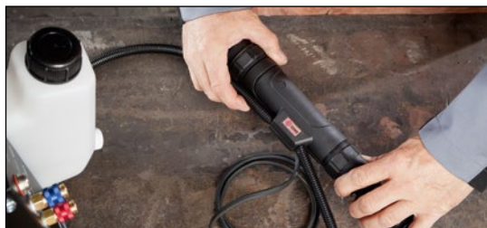
7. Assemble the machine side connection housing.