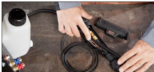
5. Insert the trigger and flow control cable into the connection housing.