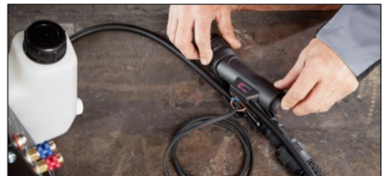
6. Lead out the flow control cable through the control cable outlet out of the housing.