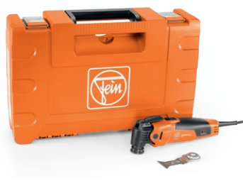
MM 500 Multimaster Starlock Oscillator