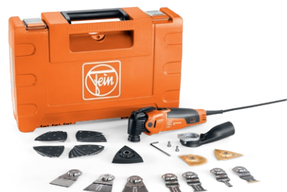
also available with additional accessories MM 500 Multimaster Starlock Oscillator TOP Set