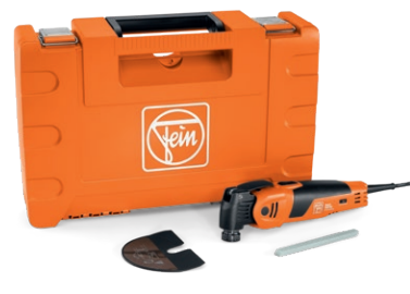
MM 700 Multimaster Automotive Oscillator 1.7Q