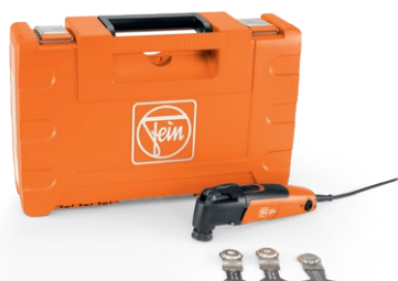
MM 300 Multimaster Starlock Oscillator START Set