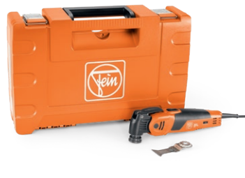
MM 700 Multimaster Starlock Oscillator