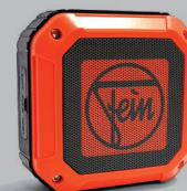
Fein Bluetooth Speaker