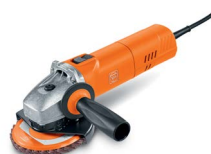
125mm 1700 W Compact Inox Angle Grinder Variable Speed