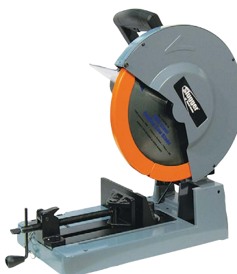
The Slugger 14" Metal Saw