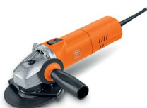
125mm 1700 W Compact Angle Grinder