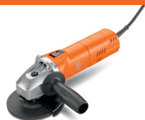
125mm 800 W Compact Angle Grinder