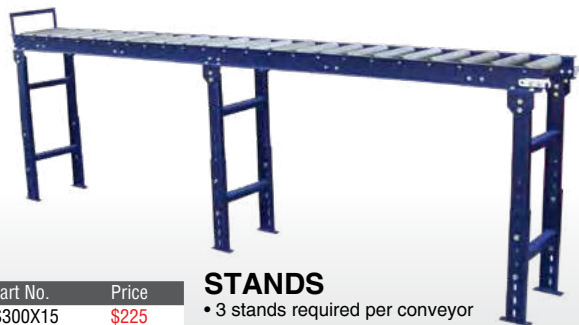
Image shows 1x RS300X3 & 3x RS300